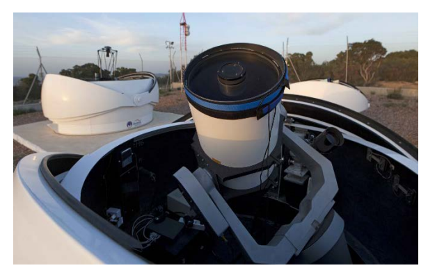
Fig. 1: The DeSS telescopes (Courtesy: Deimos Space).

This allowed to increase the chances that quick physical follow-up observations could be actually carried out.